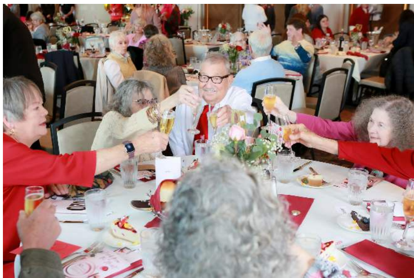
This year's Food From the Heart Luncheon raised a record $116,000 for Meals on Wheels for Santa Cruz County.