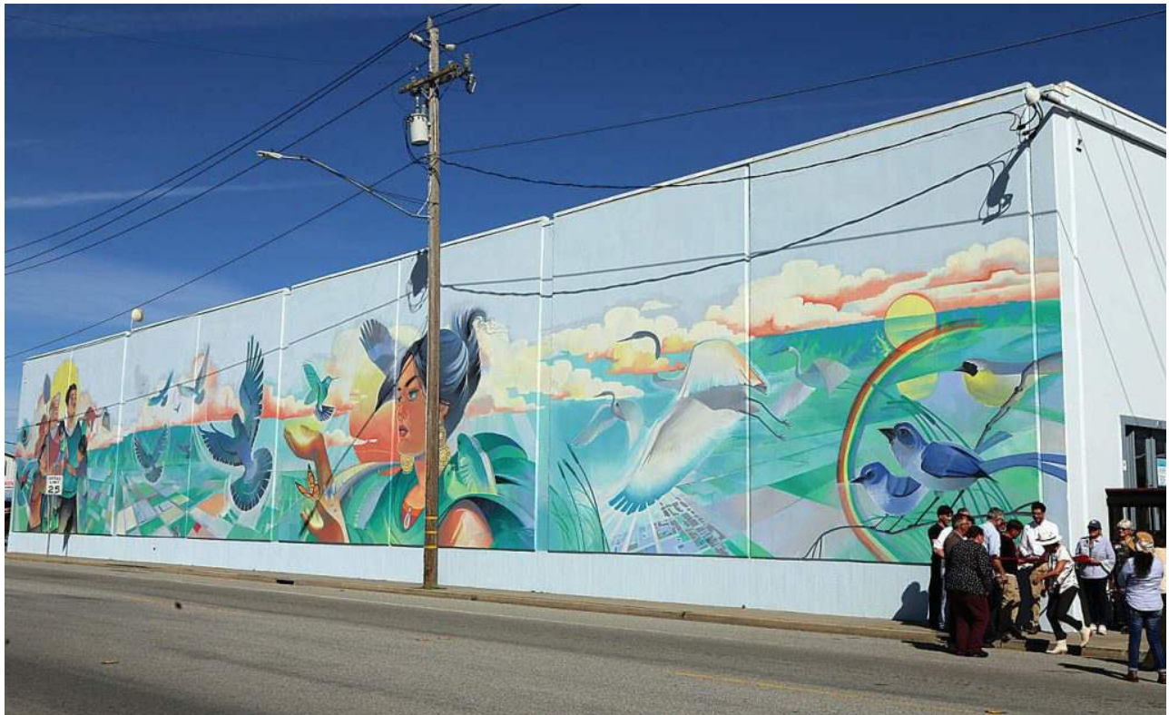
Hundreds of local families have completed Childcare Safety Plans across the Central Coast.