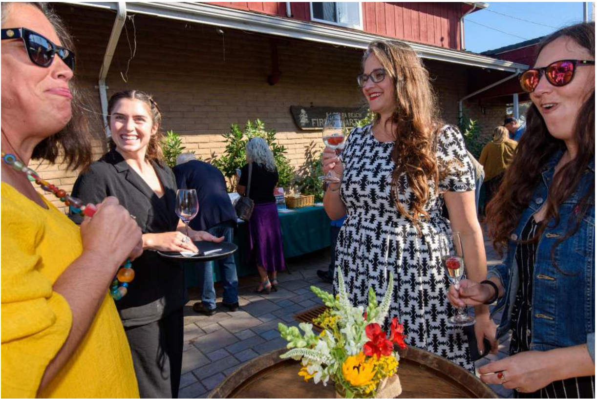
The Farm to Fork Gala is celebrating its 10th anniversary this year.