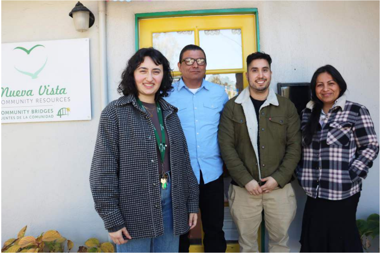
The Nueva Vista Community Resources team distributed $133,000 over two weeks to residents impacted by the Santa Cruz Wharf collapse.