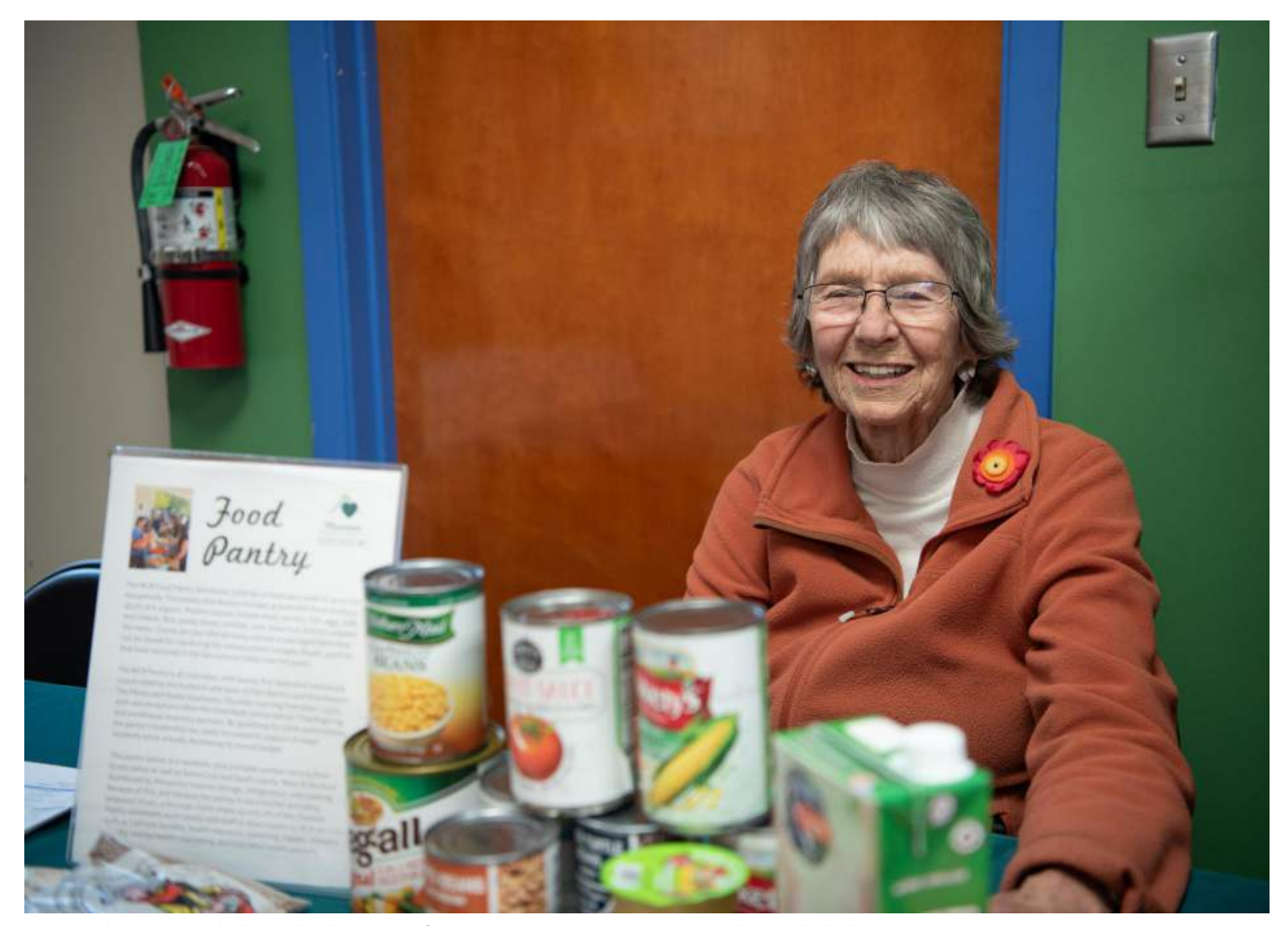
Attendees learned about the breadth of services and resources provided on a daily basis at Mountain Community Resources.

The Open House was a testament to the power of unity and collaboration. Together, we engaged in meaningful discussions, forged new connections, and reaffirmed our collective dedication to serving the needs of our community. From informative program presentations to insightful conversations with elected officials and service partners, the evening was a celebration of our shared commitment to building a stronger, more resilient San Lorenzo Valley.