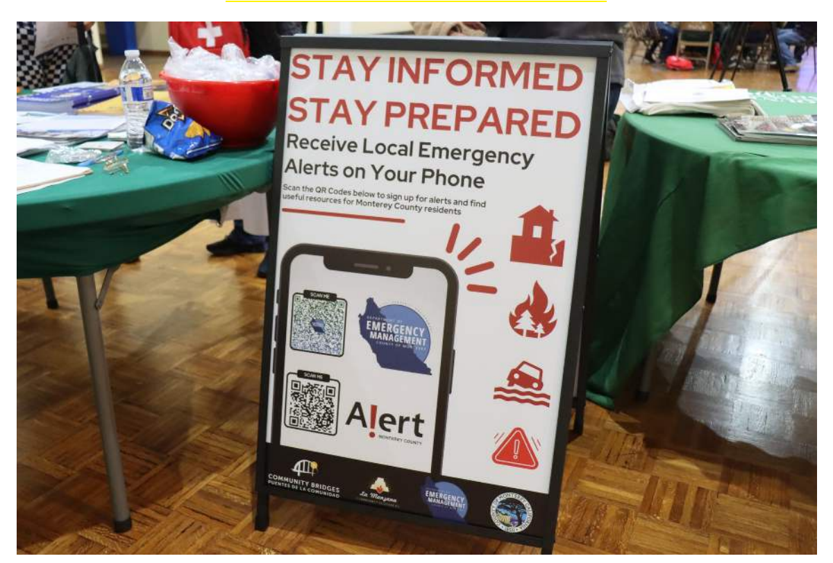
These bilingual signs are posted throughout Pajaro urging residents to sign up to receive emergency alerts from the County of Monterey to their cell phones. There are also similar signs in Santa Cruz County asking Santa Cruz County residents to sign up for alerts from the County of Santa Cruz.

Make sure you don't miss the next meeting. Sign up for our mailing list by emailing info@cbridges.org.